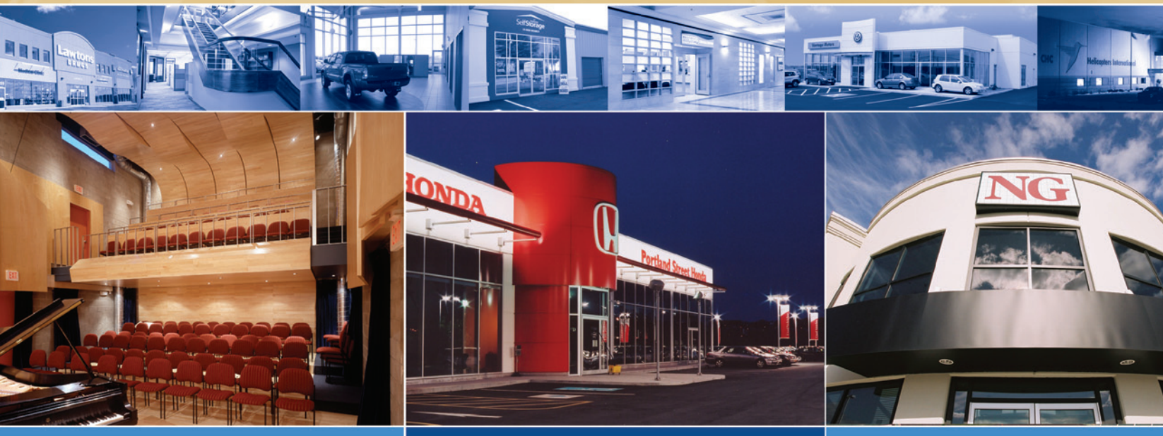
THE MUSIC ROOM

Lindsay Construction is committed to providing quality buildings that exceed clients' expectations. Our design and construction teams work together to ensure that every step of the construction process follows a strict set of guidelines established by the Lindsay Quality Program and ISO standards.