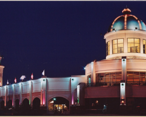
CASINO NOVA SCOTIA