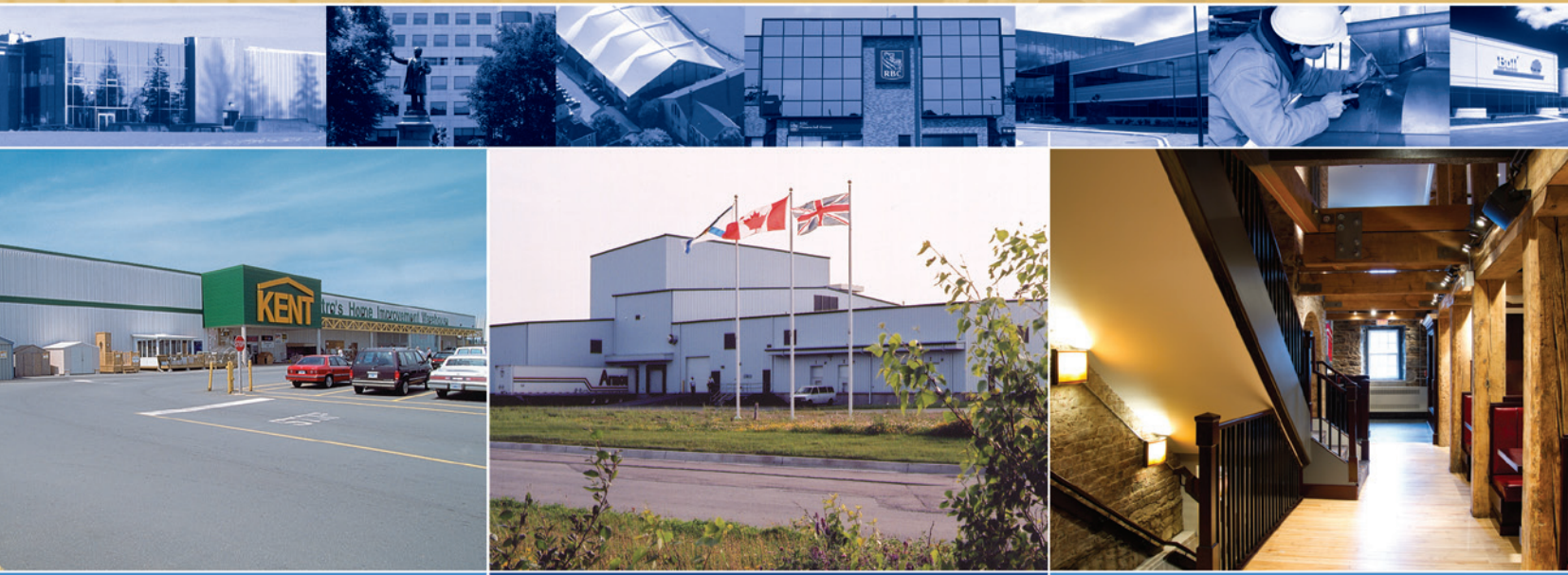
⋮ KENT BUILDING SUPPLIES

Lindsay General Contracting involves management of a construction project for a fixed price, using our clients' plans and specifications. Lindsay has enjoyed a long history as a successful General Contractor thanks to our skilled team of Estimators, Project Managers, Project Coordinators, and Site Superintendents who take pride in offering competitive bids, quality workmanship, and maximum efficiency on any size project.