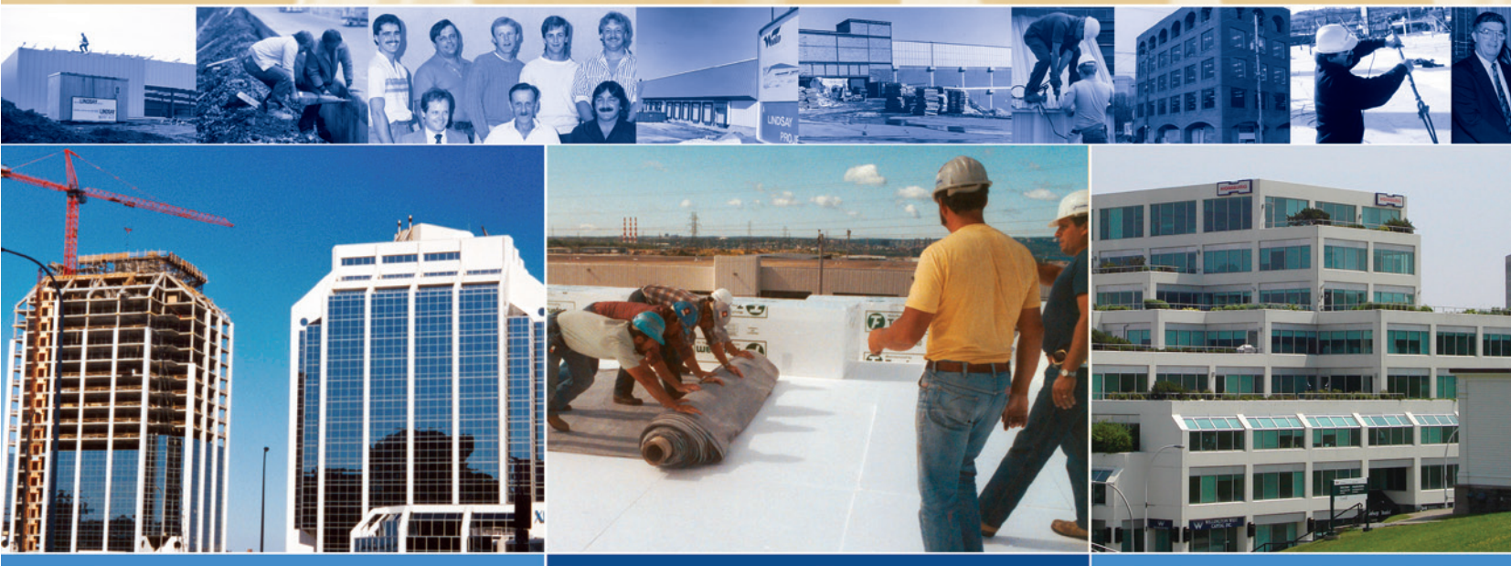
⋮ PURDY'S TOWERS

Whether the job is to make adjustments for new roof top equipment, find and repair a leak, or conduct routine maintenance, the Lindsay Roofing Service Specialists are dedicated to providing reliable, effective, and timely roofing services.