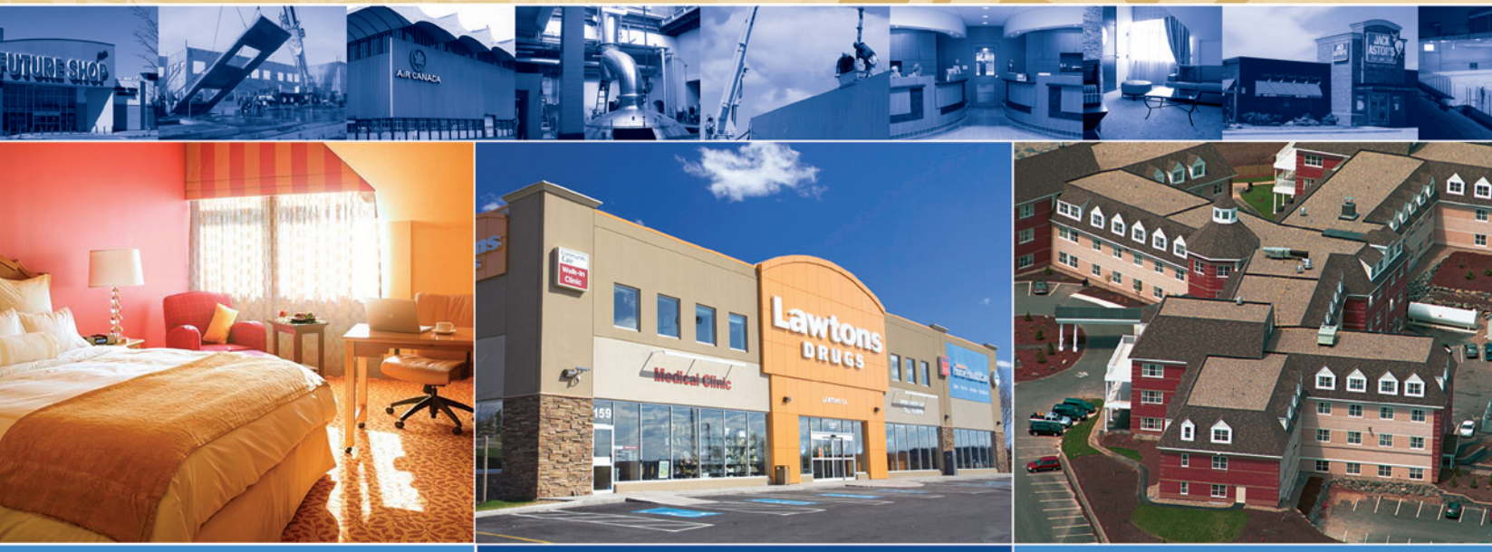
HALIFAX MARRIOTT HARBOURFRONT