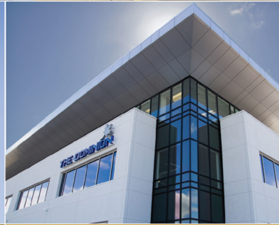
WRIGHT AND BURNSIDE CAMPUS