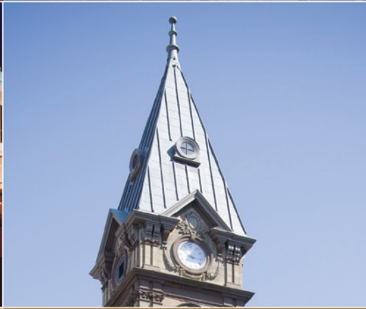
CITY HALL: CLOCK TOWER